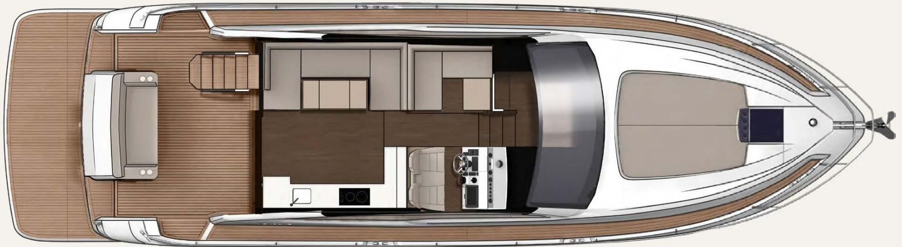
Galley up (cost option)