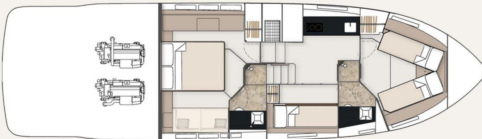
3 Cabin (cost option)