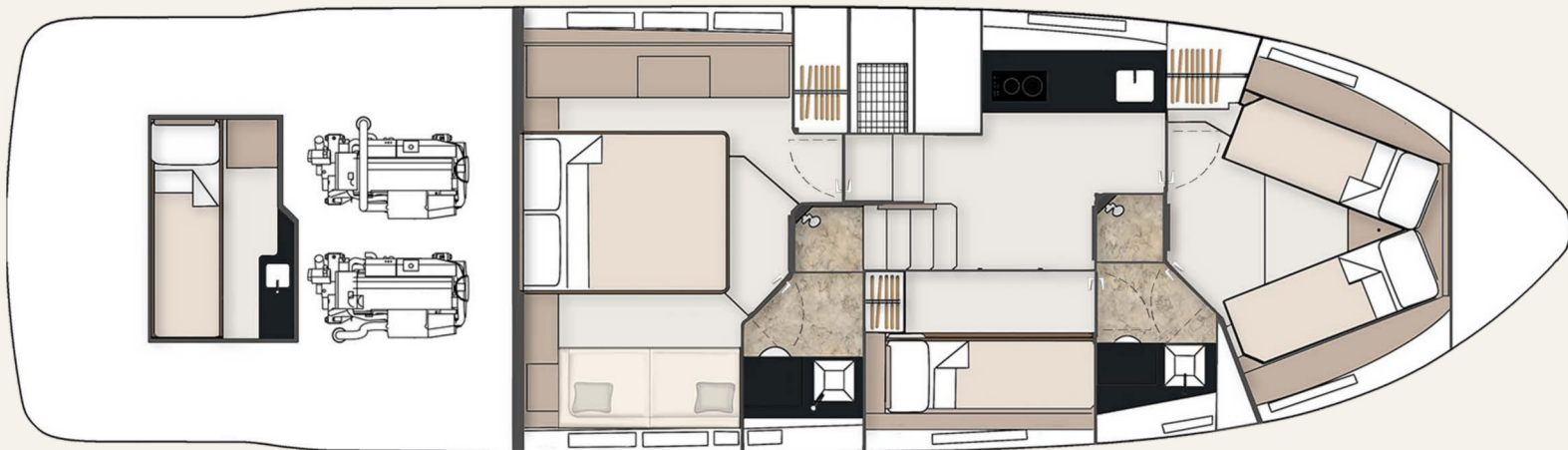
3 Cabin with Single Crew (cost option)